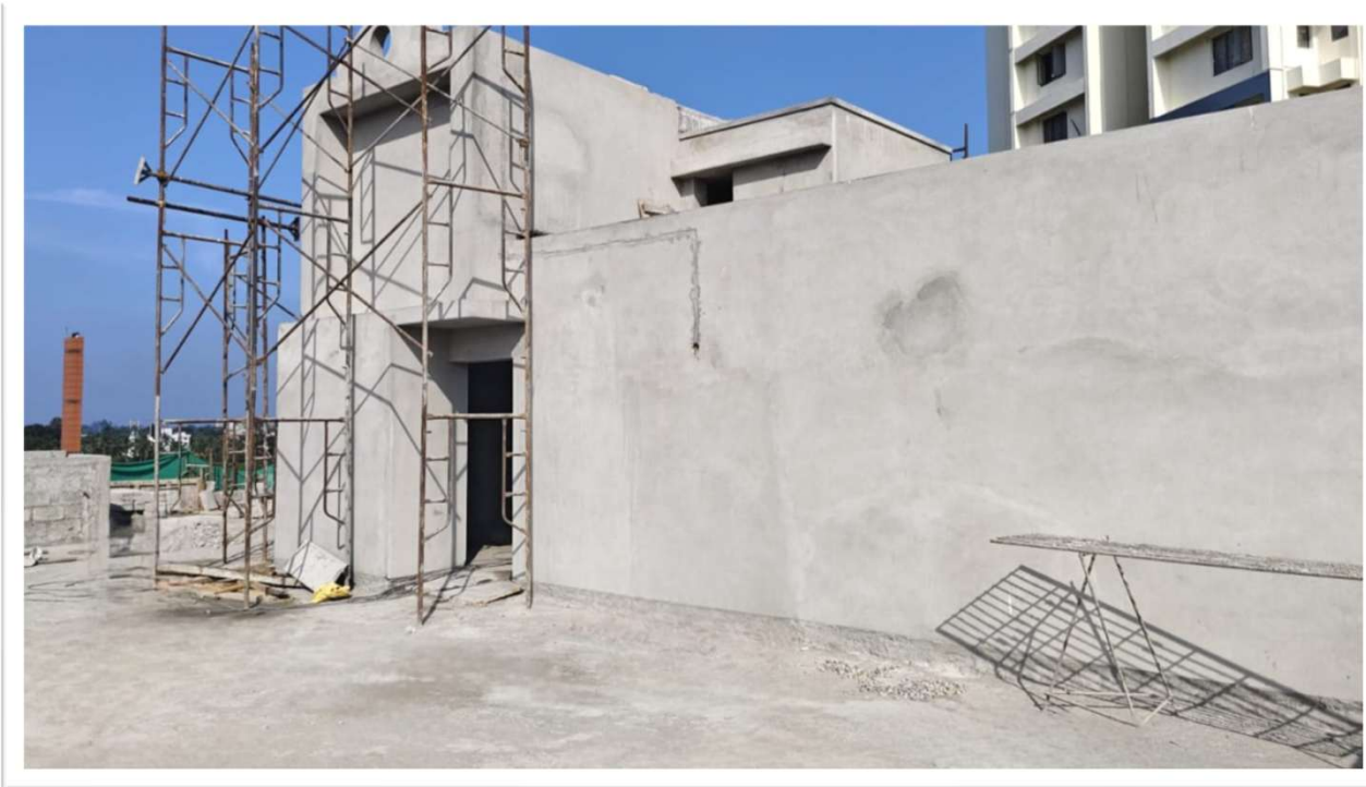
TERRACE CEILING PLASTERING & FLOOR