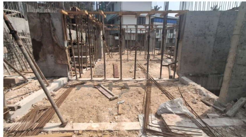
COLUMN FOOTING & RETAINING WALL