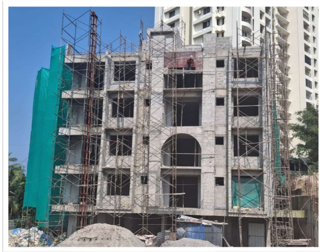
FRONT ELEVATION WORK IN PROGRESS