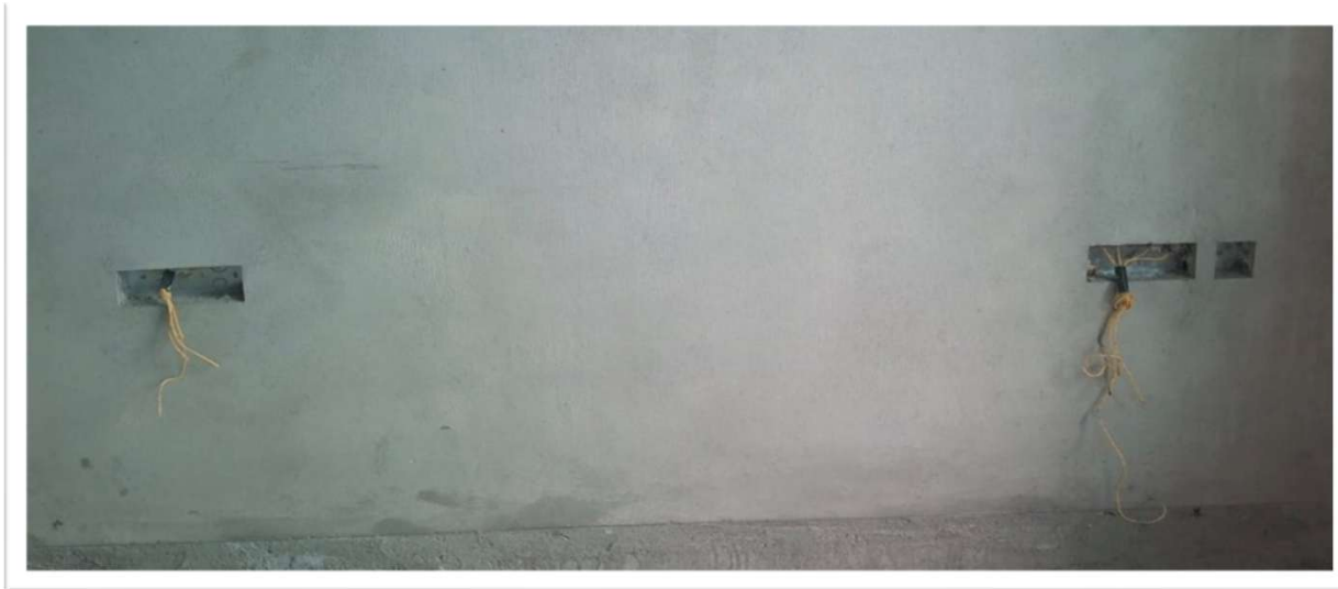
ELECTRICAL WALL CHASING & BOX FIXING