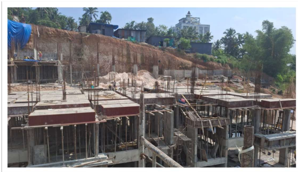
ELEVATION VIEWS - WORK IN PROGRESS