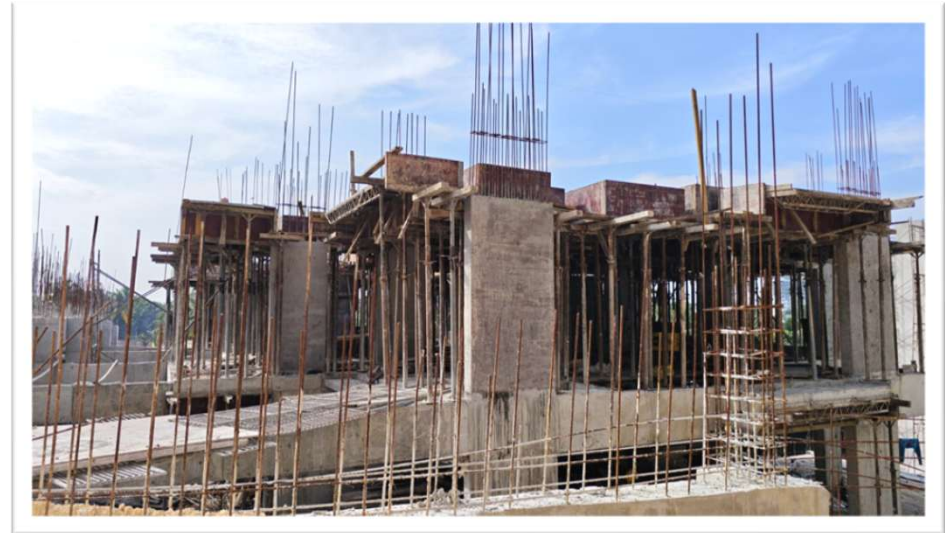
FLOOR 1 SHUTTERING WORK IN PROGRESS