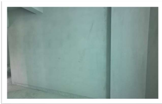
APT BLOCKWORK & PLASTERING