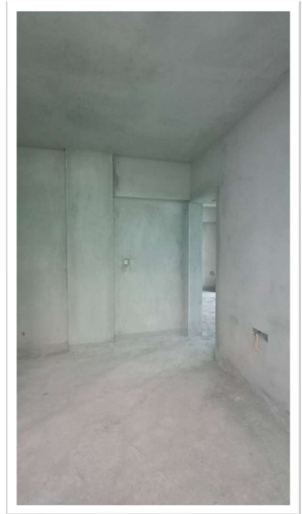
APT CEILING PLASTERING