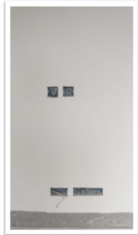
ELECTRICAL WALL CHASING & BOX FIXING