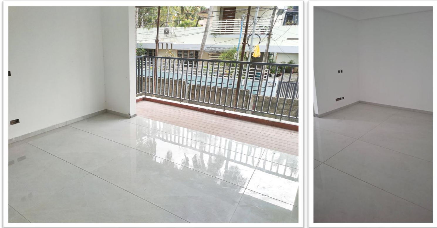
FLOORING - INSIDE, BALCONY, KITCHEN