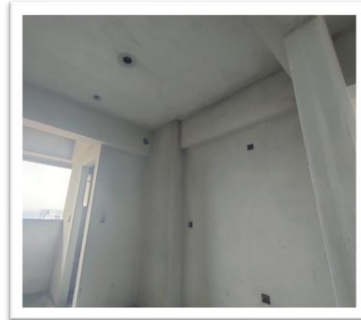
CEILING PUTTY WORK