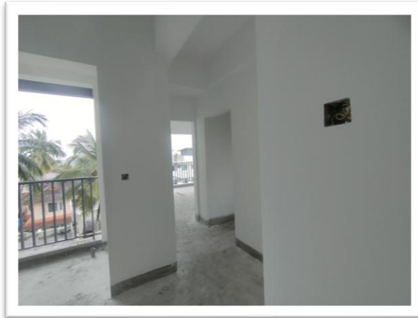
WALL PUTTY WORK